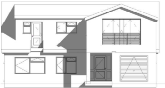
South Elevations Existing